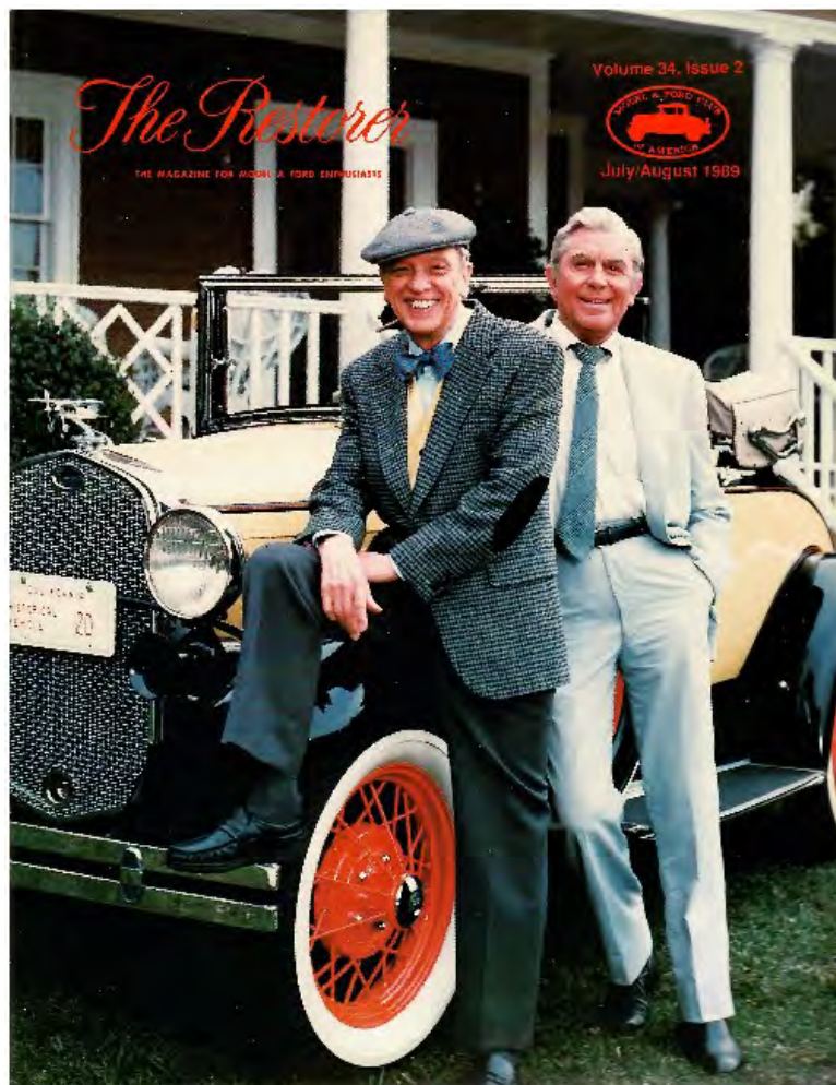
Photo: Cover of "The Restorer", Volume 34, Issue 2, July/August 1989

Excerpt from "The Restorer", Volume 34, Issue 2, July/August 1989