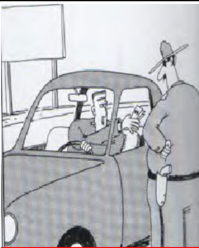
The bribe of Frankenstein